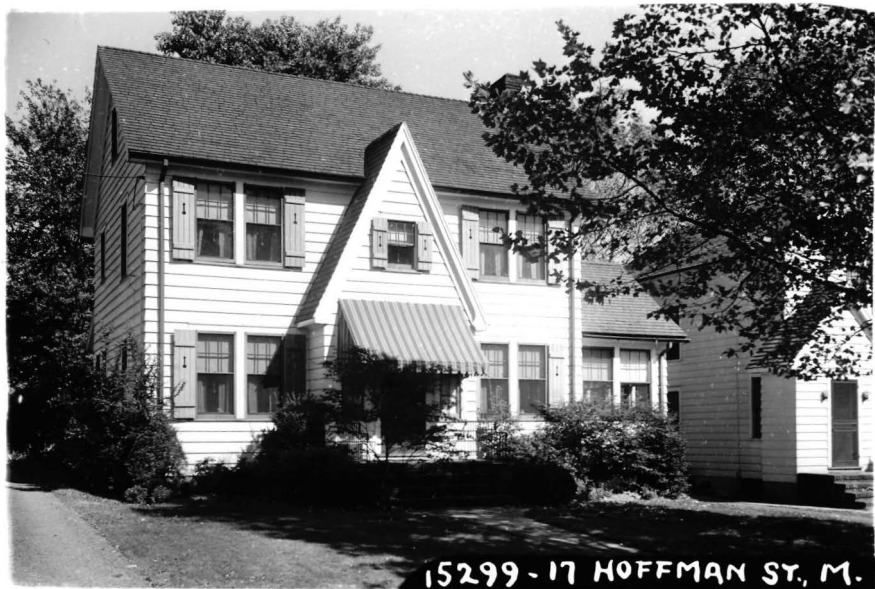
Board of Realtors of the Oranges and Maplewood.